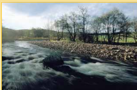
The River Livet

A few weekends ago, we were invited to a friend's house in Apollo Beach where he was kind enough to share his exotic collection of alcohol that he has gathered from all over the world. I had three different varieties of Glenlivet which aroused my curiosity. I decided to do some research, which in my world means to research with my taste buds, on the legend, brewing and varieties of Glenlivet. I had a balle balle of a time doing this research (as you can well imagine) and here are the results of my hard work and labor!