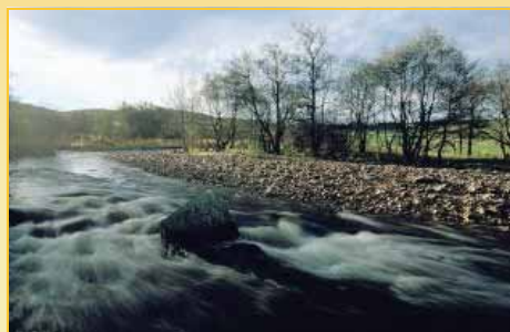
The River Livet