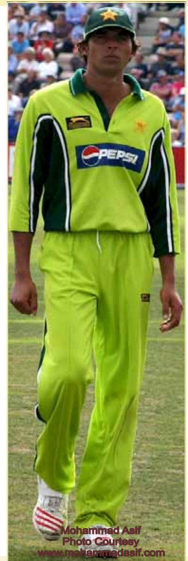
Mohammed Asif Photo Courtesy www.mohammadasif.com